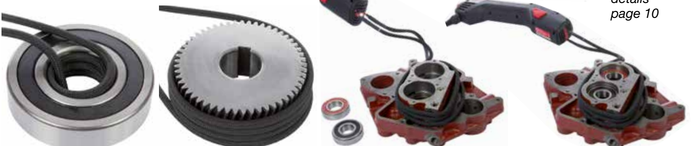
Flexible inductor for heating different kinds of parts