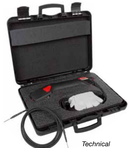
Technical details page 10